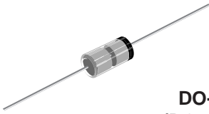
DO-204AH (DO-35 Glass)

Zener Voltage Range 3.0 to 75V Power Dissipation 500mW